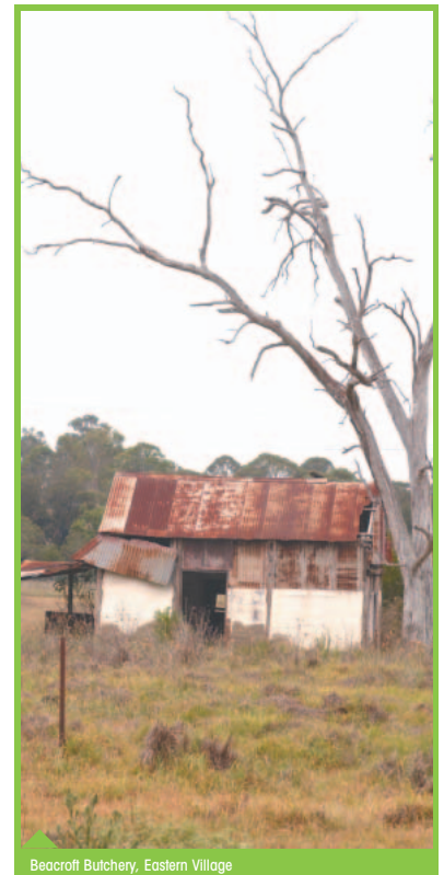
Beacroft Butchery, Eastern Village

Opportunities for recognising heritage aspects of the site may include: